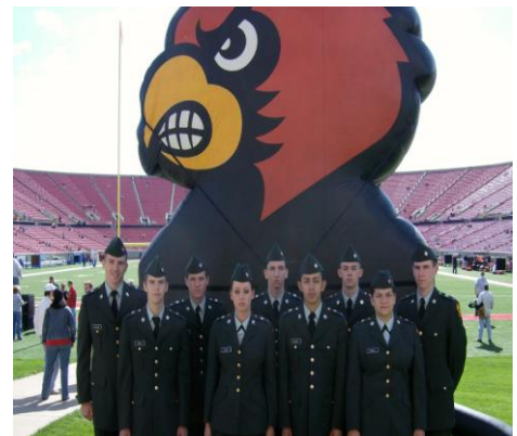
The Cardinal BN Color Guard